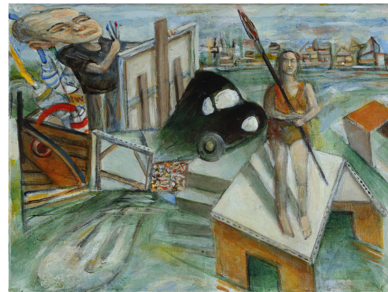
ARTURO RODRÍGUEZ Terra Incognita VI , 2020 oil on linen 12 x 16 inches