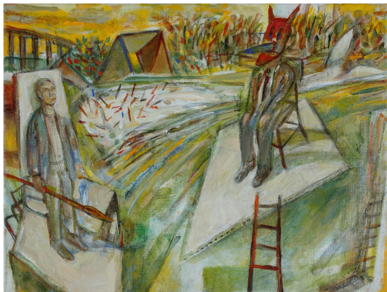
ARTURO RODRIGUEZ Terra Incognita II , 2020 oil on linen 12 x 16 inches