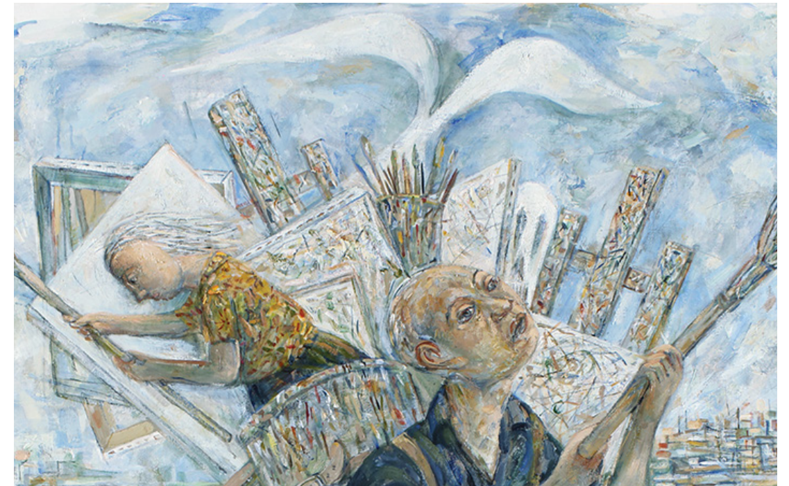
DETAIL OF ARTURO RODRÍGUEZ Terra Incognita / Variation on Courbet (The Meeting) X , 2021 oil on canvas 66 x 54 inches