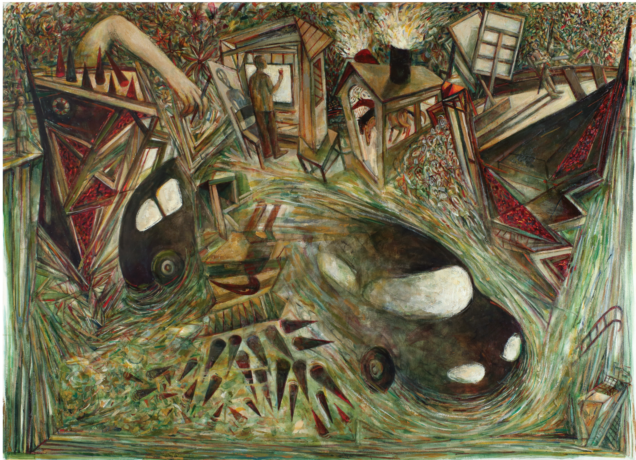
ARTURO RODRÍGUEZ Heart of Darkness , 2020 oil on canvas 48 x 66 inches