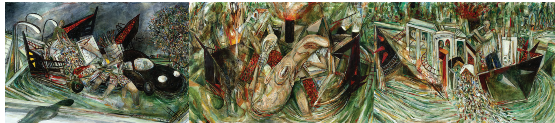
ARTURO RODRÍGUEZ, Terra Incognita / Heart of Darkness , 2019, oil on canvas, 24 x 108 inches

The visual power of Rodríguez's imagery found in the triptych Terra Incognita / Moby Dick is possessed of a sweeping, gestural energy found in Melville's prose of these writers translated into paint. The left panel of the Moby Dick triptych depicts Captain Ahab's ship, The Pequod , transformed into Rodríguez's quest for painterly expression. In assured passages of painterly expressiveness, Rodríguez performs the dramatis personae of Melville's novel rendering their saga as a process of color and form, wherein Moby Dick becomes the artist's obsession. In the right panel, Moby Dick has been conquered and transformed by the brush-harpoons into a modern conveyance, a car with the form of a whale's head – the past becoming the present. Rodríguez's triptych, seen within the context of his painterly pursuits creates a vision of Moby Dick that defamiliarizes, disturbs and entrances in an uncanny process of transmogrification, as the whale/car becomes a reality transformed by the artist's imagination.