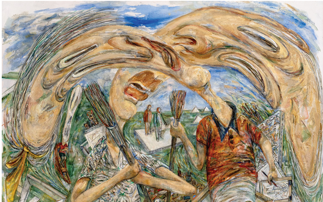
DETAIL OF ARTURO RODRÍGUEZ Terra Incognita / Variation on Courbet (The Meeting) VII , 2021 oil on canvas 90 x 66 inches