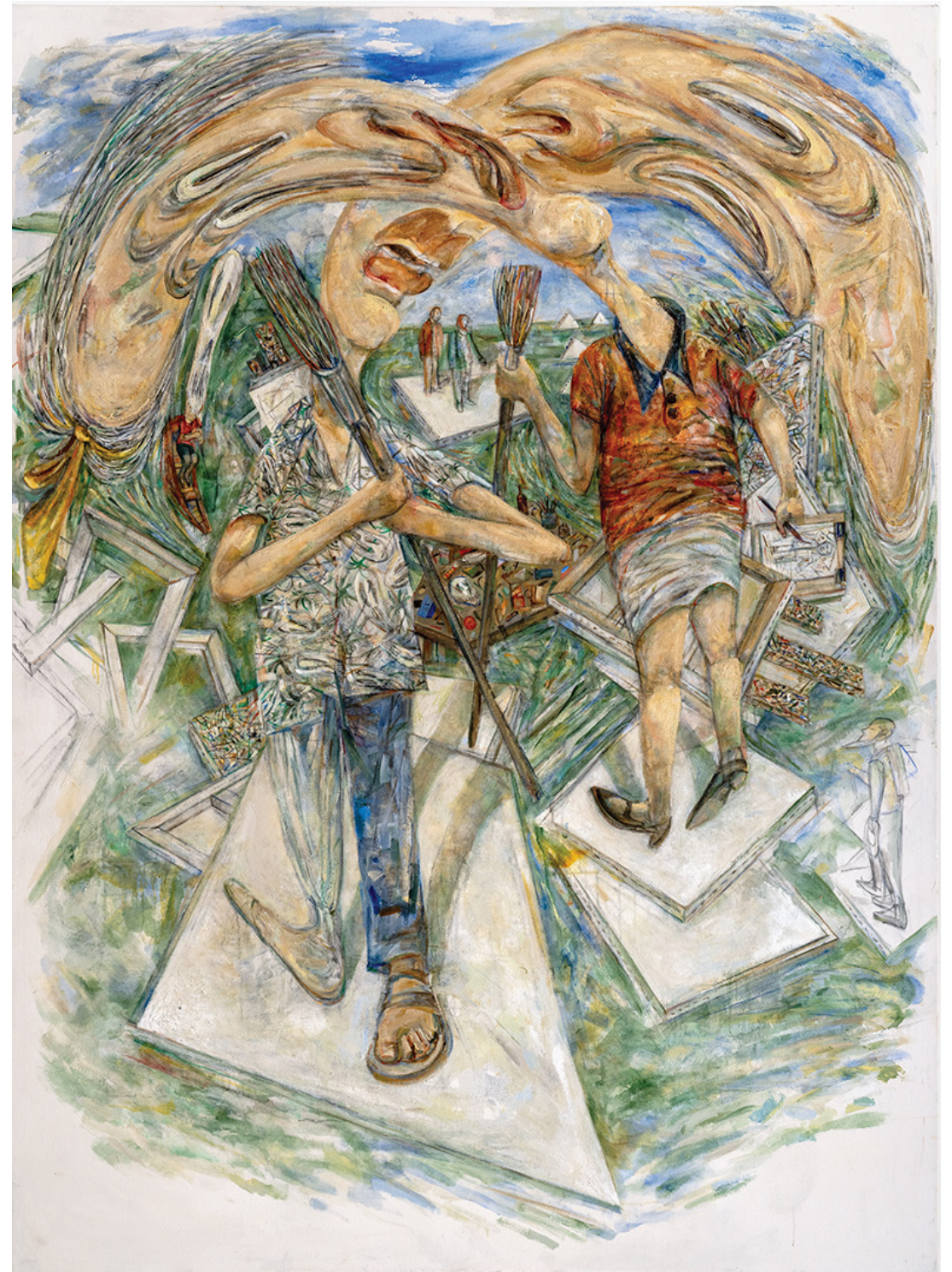
OPPOSITE PAGE | ARTURO RODRÍGUEZ Terra Incognita / Variation on Courbet (The Meeting) VII , 2021 oil on canvas 90 x 66 inches