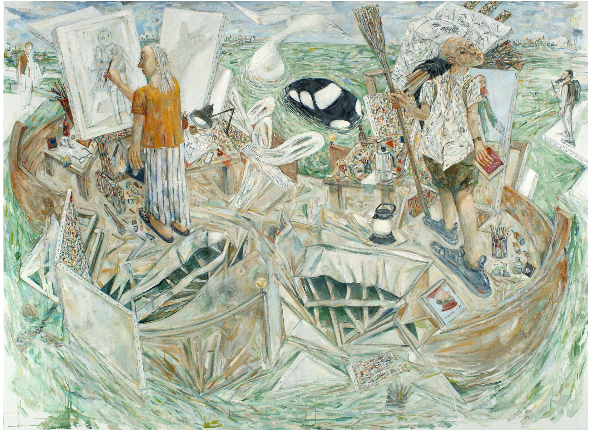
ARTURO RODRÍGUEZ Terra Incognita / Variation on Courbet (The Meeting) XX, 2021 oil on canvas 66 x 90 inches