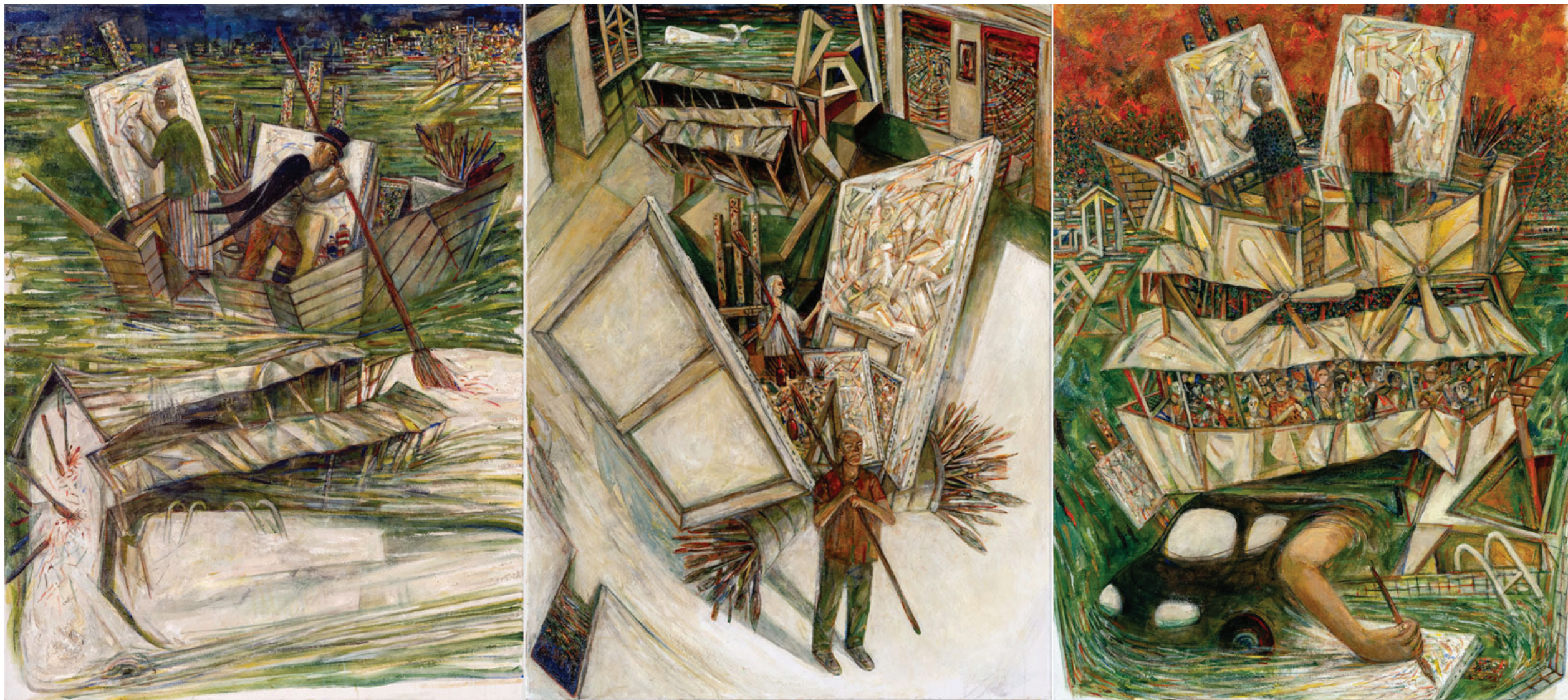
ARTURO RODRÍGUEZ Terra Incognita Triptych , 2021 oil on canvas triptych 40 x 90 inches