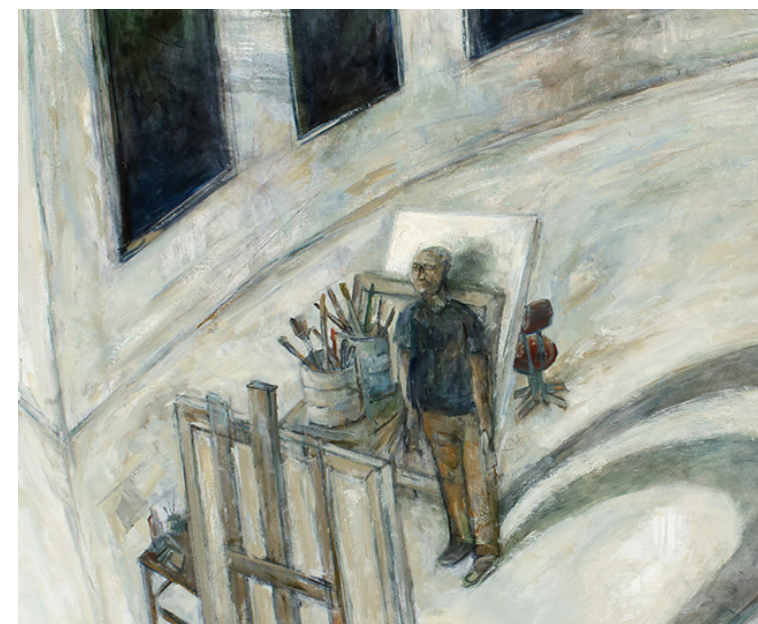
DETAIL OF ARTURO RODRÍGUEZ Terra Incognita / Journey to the End of the Night , 2020 oil on canvas 66 x 56 inches

- LOUIS-FERDINAND CÉLINE, JOURNEY TO THE END OF THE NIGHT