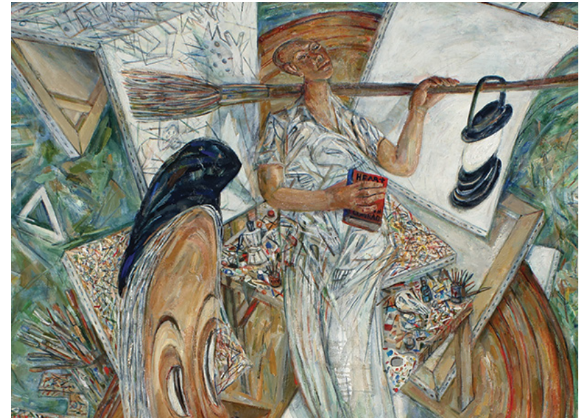
DETAIL OF ARTURO RODRÍGUEZ Terra Incognita / Variation on Courbet (The Meeting) IX, 2021 oil on canvas 99 x 66 inches