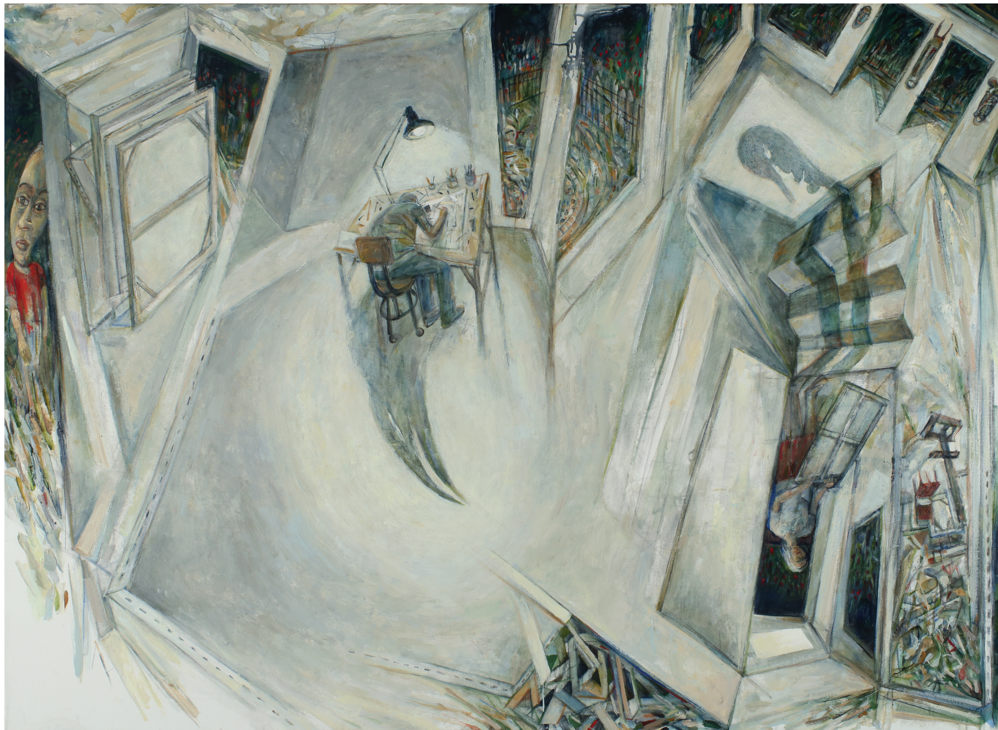
ARTURO RODRÍGUEZ Journey to the End of the Night , 2020 oil on canvas 48 x 66 inches