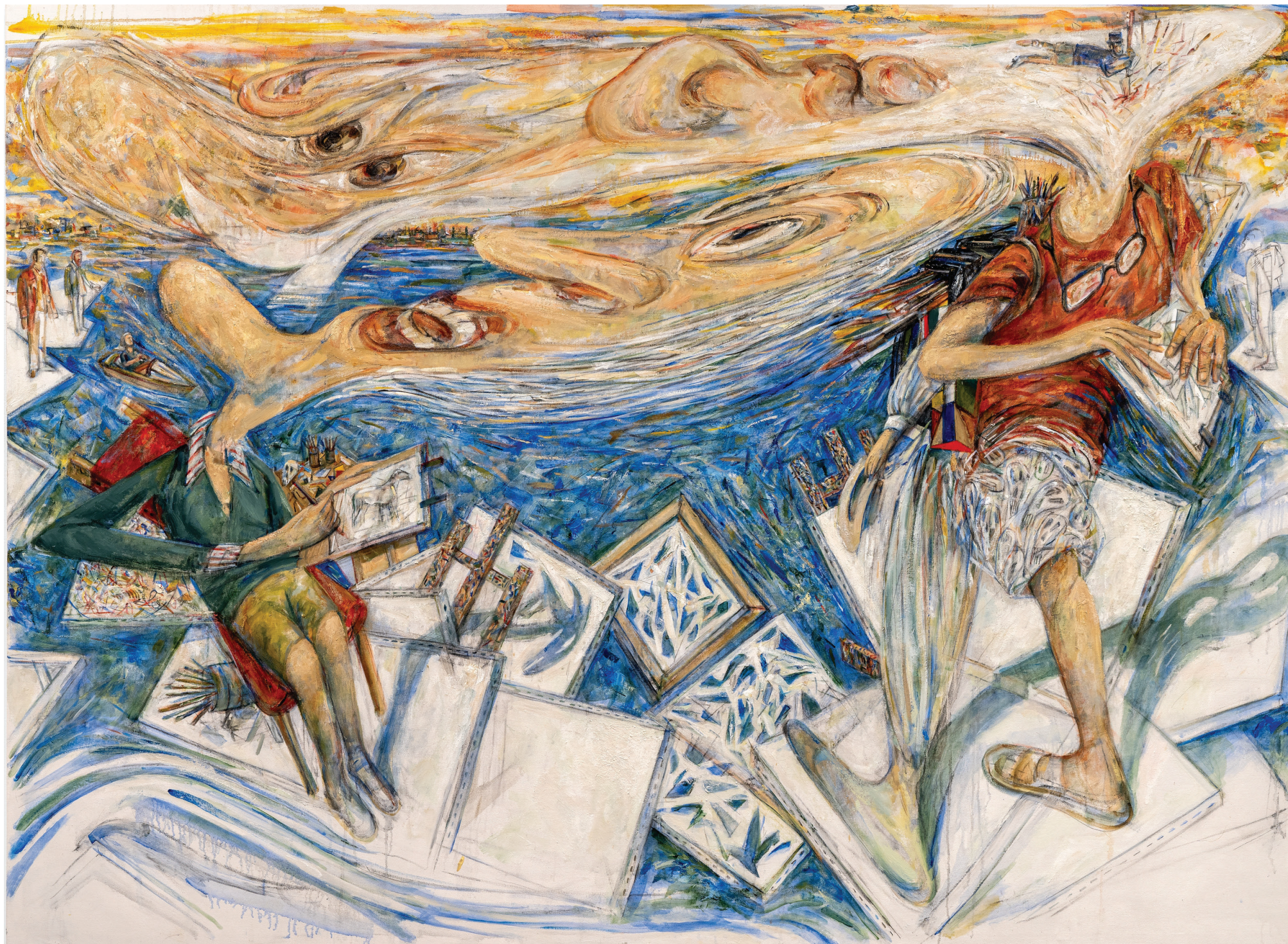
ARTURO RODRÍGUEZ Terra Incognita / Variation on Courbet (The Meeting) VIII, 2021 oil on canvas 66 x 90 inches