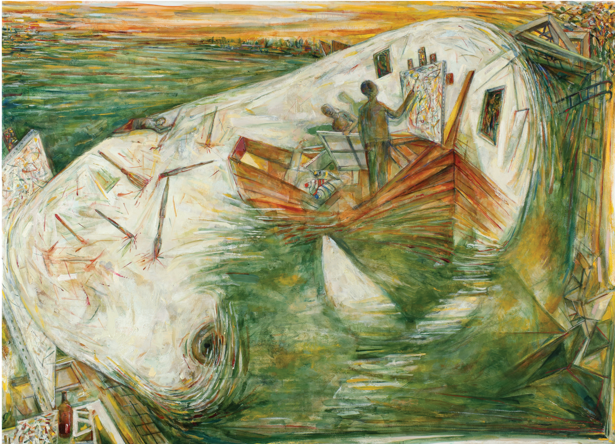
ARTURO RODRÍGUEZ Moby Dick , 2020 oil on canvas 48 x 66 inches