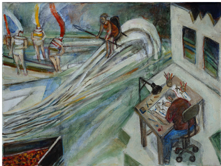
ARTURO RODRÍGUEZ Terra Incognita VII , 2020 oil on linen 12 x 16 inches