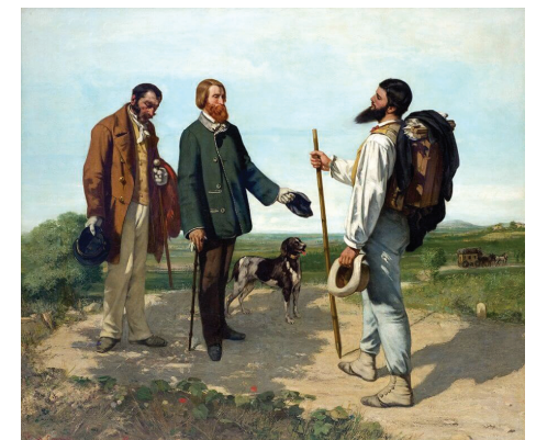
GUSTAVE COURBET’S “ The Meeting ” or “ La rencontre, ou ‘Bonjour Monsieur Courbet’ ” (1853), Musée Fabre, Montpellier, France.