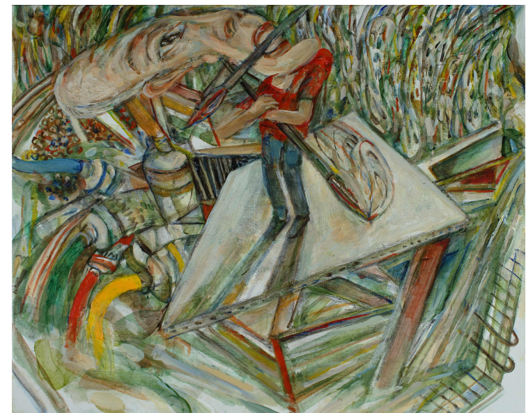
ARTURO RODRÍGUEZ Terra Incognita XIV , 2020 oil on linen 12 x 16 inches