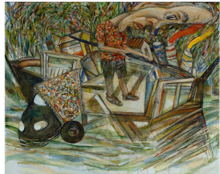
Terra Incognita XV , 2020 oil on linen 12 x 16 inches