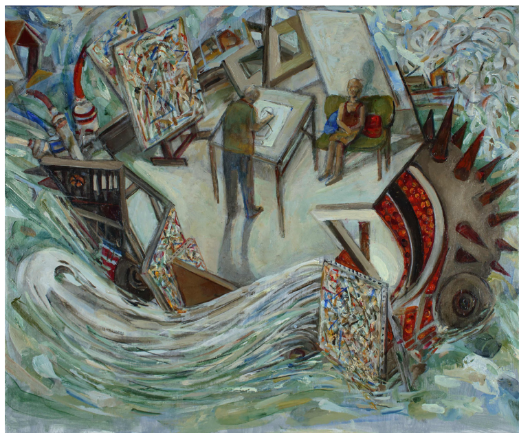
Terra Incognita XIII , 2020 oil on linen 12 x 16 inches