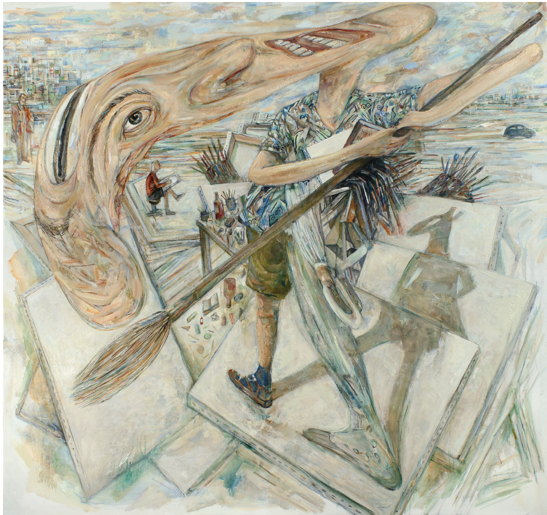
ARTURO RODRÍGUEZ Terra Incognita / Variation on Courbet (The Meeting) IV , 2021 oil on canvas 58 x 62 inches