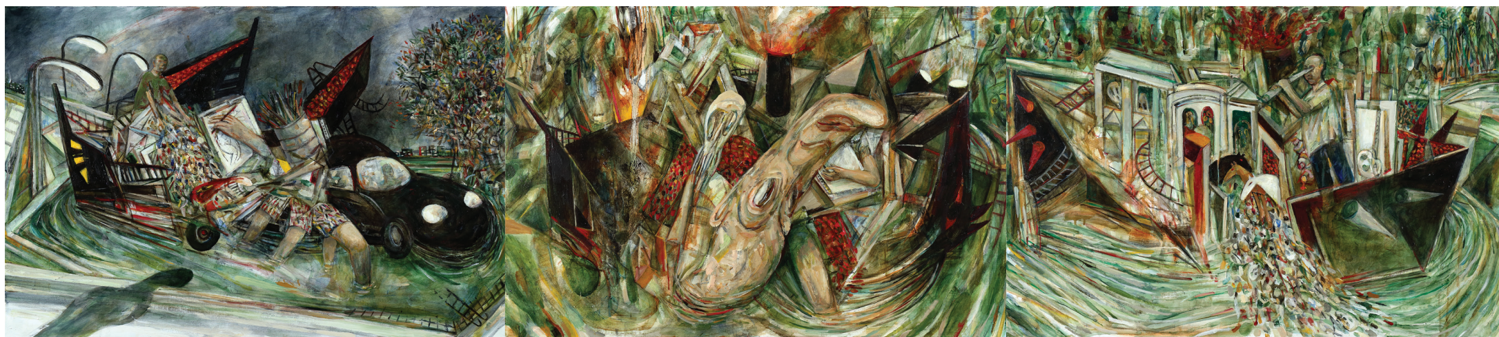
ARTURO RODRÍGUEZ Terra Incognita / Moby Dick, Journey to The End of The Night, and Heart of Darkness, 2019 oil on canvas, triptych panels 24 x 108 inches each 72 x 108 inches total