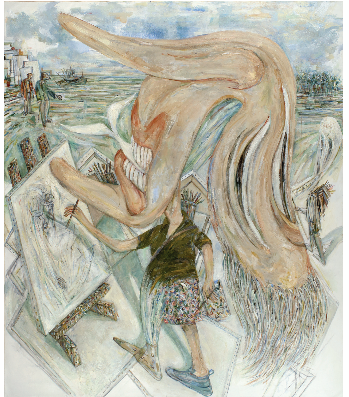
OPPOSITE PAGE | ARTURO RODRÍGUEZ Terra Incognita / Variation on Courbet (The Meeting) V , 2021 oil on canvas 66 x 58 inches